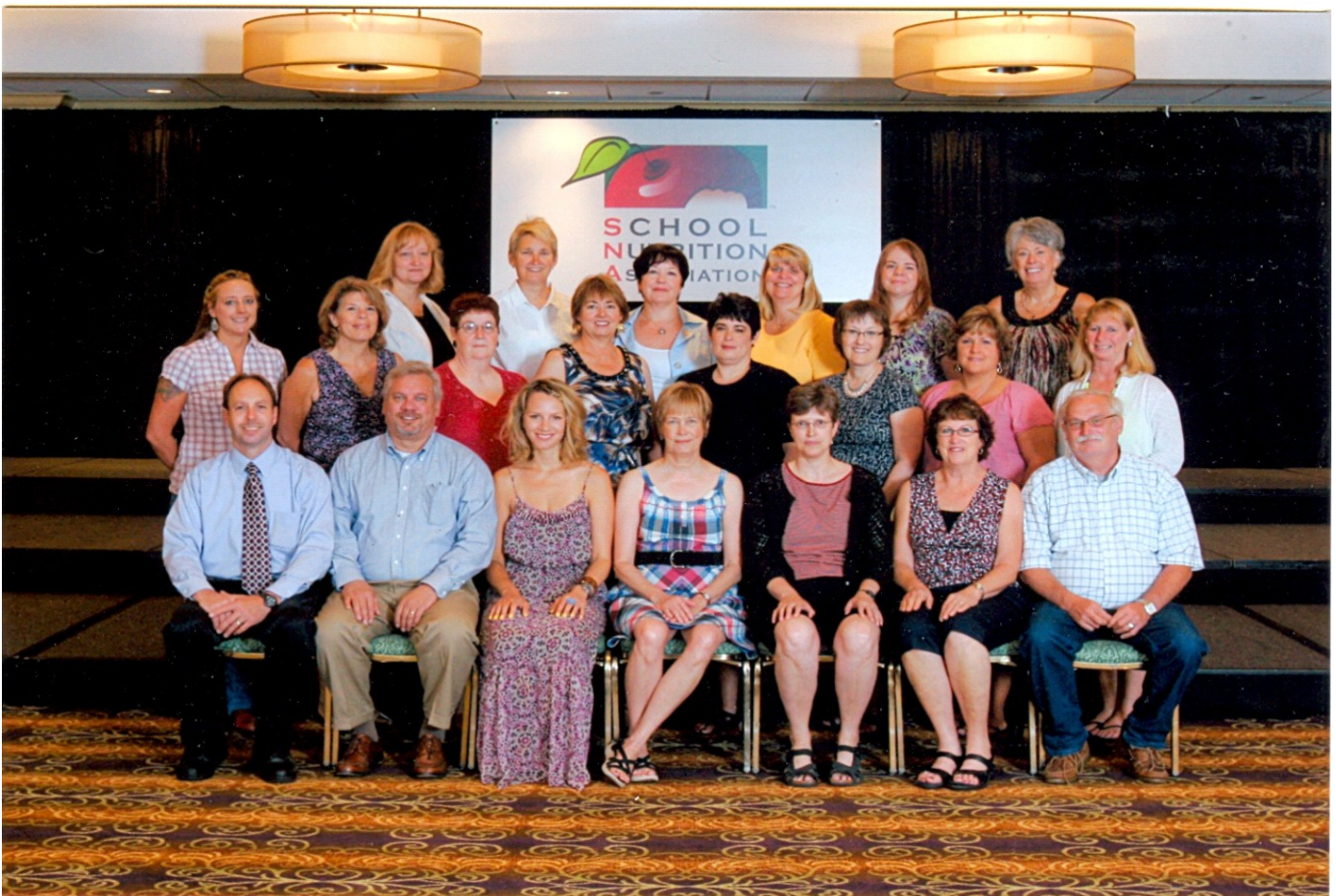
OSNA members who attended the Annual National Conference in Nashville, Tennessee

2012 Annual National Conference, July 15th—18th, 2012, Denver CO 2013 Annual National Conference, July 13—17th 2013, Kansas City, MO 2014 Annual National Conference, July 12– 16th, Boston, MA